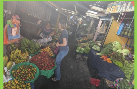
visiting the local market