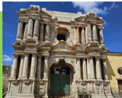
tour of historic churches/Antigua