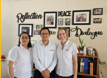
meeting the team at CEDEPCA