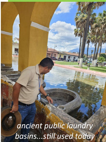
ancient public laundry basins...still used today